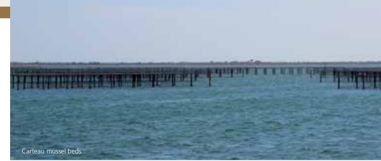
Carteau mussel beds